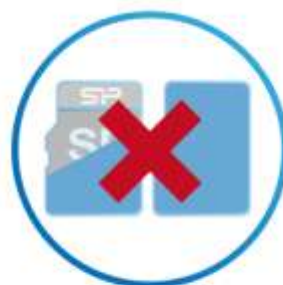
DAMAGED OR TOM LABEL