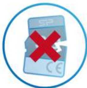
DAMAGED OUTWARD APPEARANCE